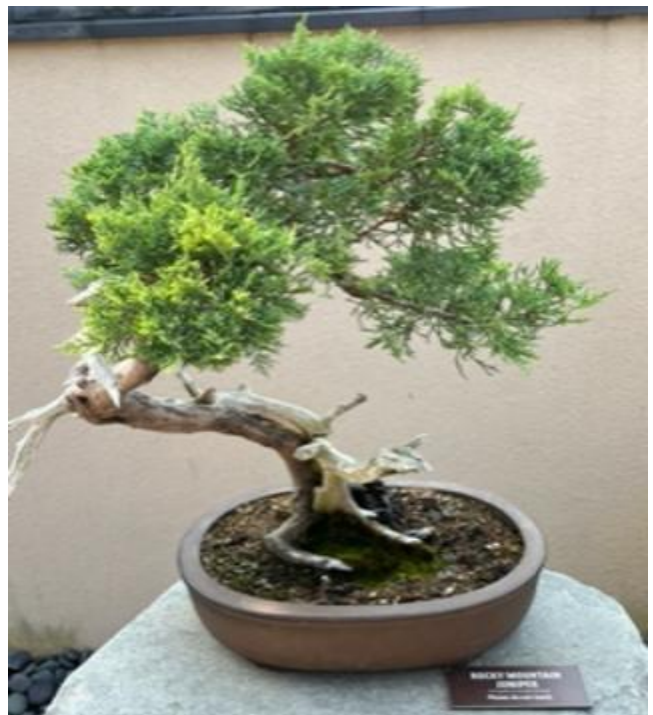
Rocky Mountain Juniper