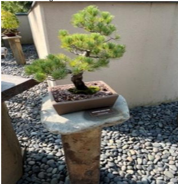
Japanese White Pine