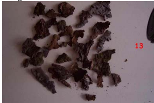
You will then need to collect a good variety of bark samples. It is best if you can collect them from a mature, non-bonsai somewhere in the landscape.