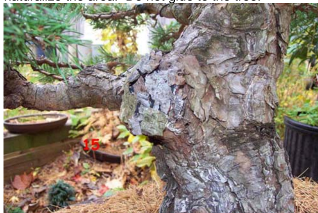
The finished result is good enough to be used on a front view of the tree as can be seen in Figure 15.