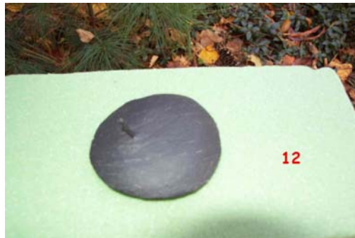
It was painted a dark color (at least as dark as the bark) in Figure 12. .