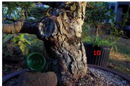
Figure 10 shows a large old pruning scar which is never going to heal over. That's the bottom of a beer bottle for size comparison.

Here is a piece contributed by Fred Knobloch on how to cover over an injury in a rough-barked tree that will not heal.