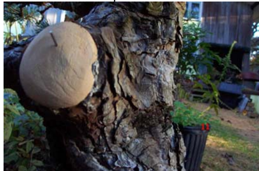
In figure 11, Fred has fashioned a cover to match the hole - this one from a cedar shingle. It was then waterproofed with Minwax wood hardener.